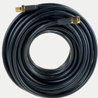
TIMENET Pro Antenna Extension Cable 10 metres