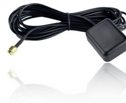
TIMENET Pro comes with antenna and 5 metre cable included